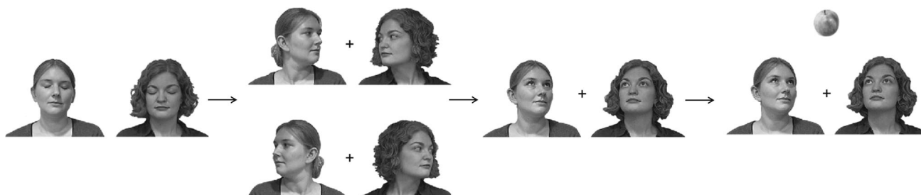
Fig. 1 Schematic illustration of the event sequence. After looking straight ahead, the two faces looked at each other or away from each other, and then simultaneously shifted their gaze up or down. After stimulus onset asynchronies of 500, 600, or 700 ms, the target (apple

or pear) appeared at a location that was either congruent or incongruent in regard to the gaze cues. In the schematic image above the faces look at each other and the target (apple) appears at the gaze congruent location